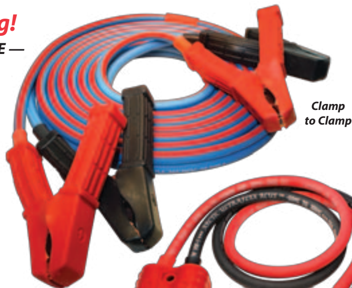
Clamp to Clamp