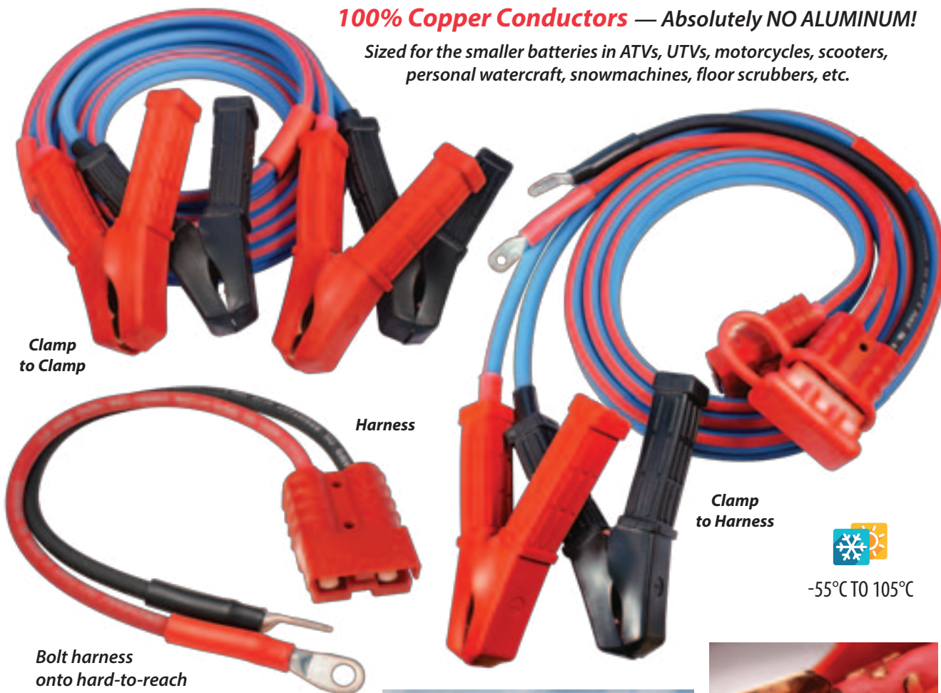
Clamp to Clamp

Sized for the smaller batteries in ATVs, UTVs, motorcycles, scooters, personal watercraft, snowmachines, floor scrubbers, etc.