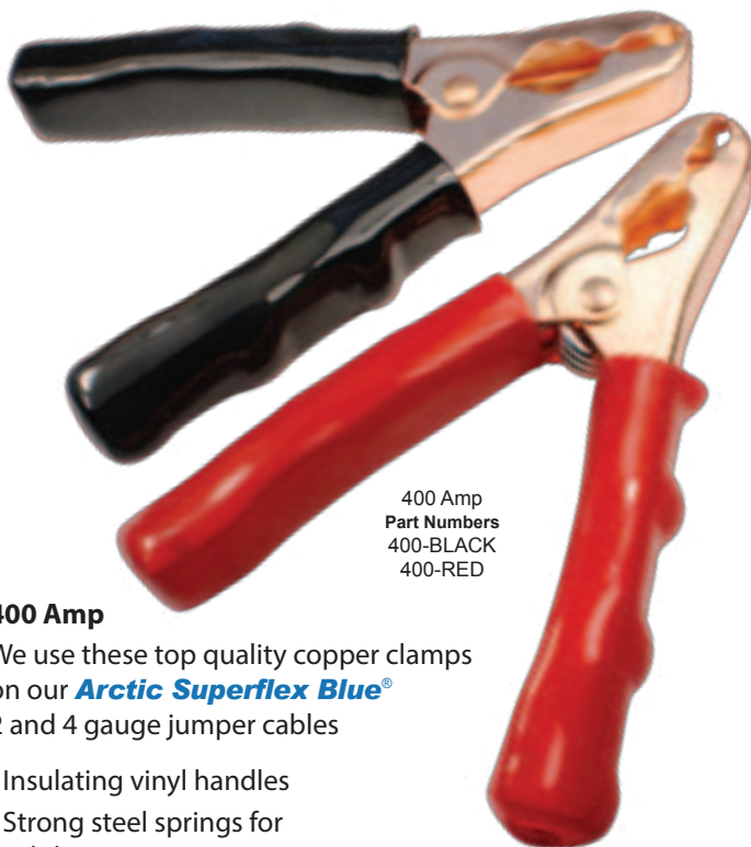
400 Amp Part Numbers 400-BLACK 400-RED