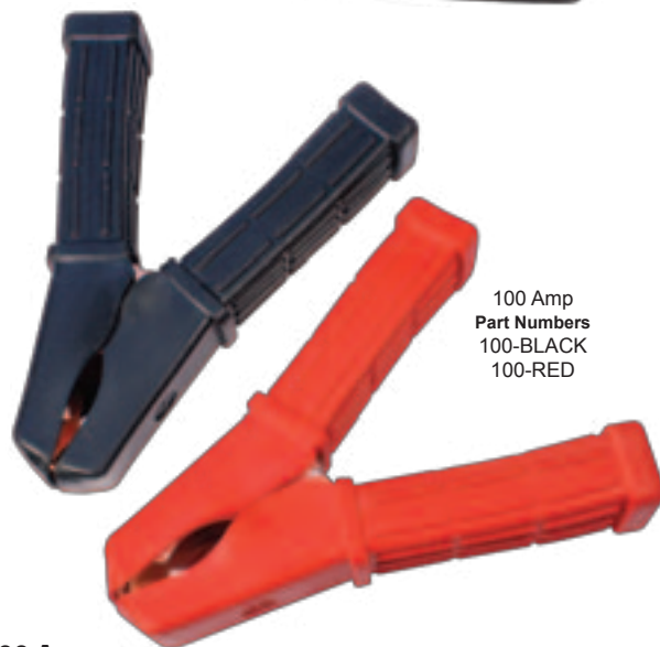
100 Amp Part Numbers 100-BLACK 100-RED