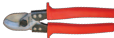
Part Number 200-006