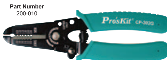
Part Number 200-010