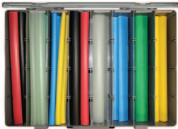
COLOR HEAT SHRINK KIT Part Number KIT-HS-COLOR Double-satchel kit stocked with adhesive-lined dual wall heat shrink tubing in 12" lengths and diameters of 1/8" to 1". Black, red, clear, white, green, yellow, and blue. 124 pieces. Two drawer satchels.

For heat shrink specifications, see pages 43 and 44