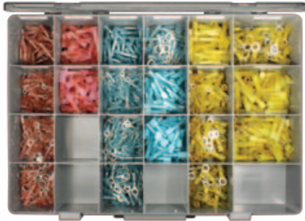
HEAT SEAL BASIC KIT Part Number KIT-HSEAL/BASIC Popular 22-10 gauge ring terminals, male and female quick slides, and splices. 1000 pieces. Drawer satchel.