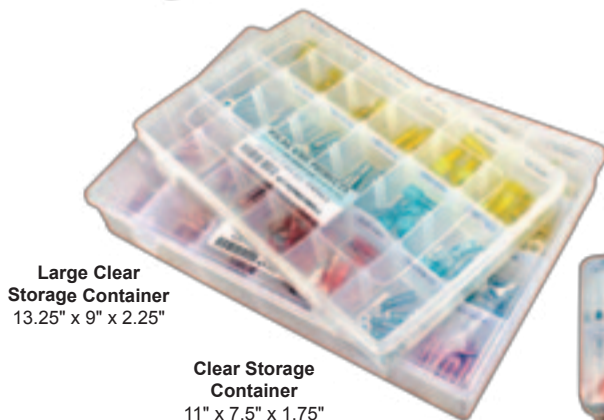
Large Clear Storage Container 13.25" x 9" x 2.25"