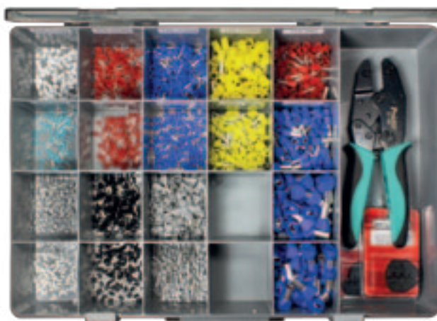
LARGE FERRULE KIT Part Number KIT-FERRULE-LG Nylon insulated ferrules and twin ferrules in 22 to 6 gauge (except 8 twin), with a quality crimp frame and two die sets. 1703 pieces. Drawer satchel.

See Plated Lug specifications on page 46, Battery Terminals on page 55, Boots on page 58, and Ferrules on page 88