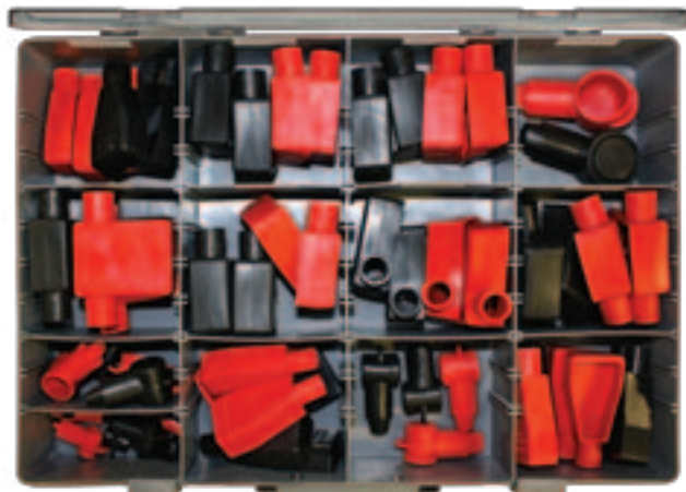
BATTERY BOOT KIT Part Number KIT-BOOT Top mount, flag, elbow, and alternator stud style boot covers in red and black. 10-18, 8-2, 2-1, 1/0-2/0, and 3/0-4/0. 54 pieces. Drawer satchel.