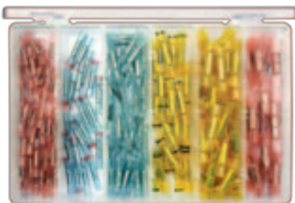
HEAT SEAL SPLICE KIT 22-18, 16-14, 12-10 and 8 gauge heat seal splices; 22-18 to 16-14, and 16-14 to 12-10 gauge stepdowns. 210 pieces. Clear storage container. Part Number KIT-HSEALSPLICE