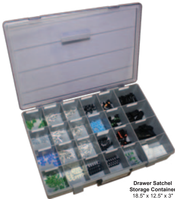
Drawer Satchel Storage Container 18.5" x 12.5" x 3"

Choose from our wide range of preassembled kits in three container sizes—or design your own custom kit from our extensive inventory of parts, and we'll put it together for you. Our drawer satchel and clear container storage systems can be configured and filled with exactly what you need to keep your projects and processes supplied.