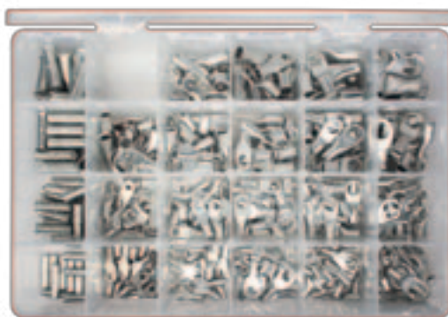
8 TO 2 GA SMALL PLATED LUG KIT Heavy-duty closed-end plated copper lugs and butt splices. #10 stud size in 8, 6, and 4 gauge, and 1/4", 5/16", 3/8", and 1/2" stud sizes in 8, 6, 4, and 2 gauge. 320 pieces. Large clear storage container. Part Number KIT-BCL-SMALL