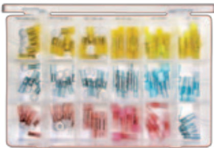
HEAT SEAL TERMINAL KIT 22-10 gauge heat seal ring terminals, quick slide terminals, and splices in a variety of popular sizes. 90 pieces. Clear storage container. Part Number KIT-HSEAL/SMALL