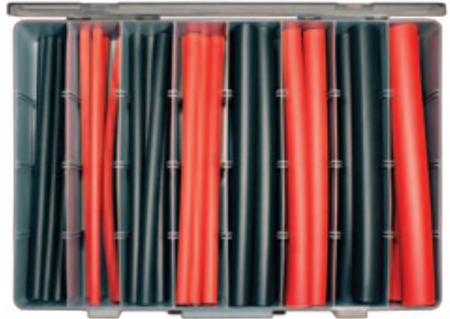
HEAVY DUTY HEAT SHRINK KIT Part Number KIT-HS-HD Black and red adhesive lined heavy wall heat shrink tubing in 12" lengths. 1/3", 1/2", 3/4" and 1" diameters. 32 pieces. Drawer satchel.

Polar Wire Arctic Ultraflex Blue® custom cables link the solar batteries in this energy storage bank. Our cables are finished with tough, adhesive lined heat shrink to seal out dirt and corrosion.