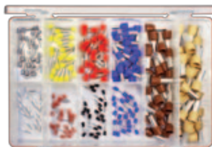
FERRULE KIT Nylon insulated ferrules in ten sizes from 20 to 2 gauge. 250 pieces. Clear storage container. Part Number KIT-FERRULE