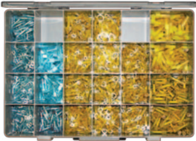
HEAT SEAL MASTER KIT Part Number KIT-HEAT-SEALX2 22-10 gauge heat seal ring, spade, and quick slide terminals in a variety of sizes, with butts and stepdowns. Includes a high quality heat seal crimpers. 1901 pieces. Two drawer satchels.