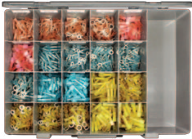
HEAT SEAL FIELD KIT Part Number KIT-HSEAL/FIELD 22-10 gauge ring terminals, quick slide terminals, splices. 1000 pieces. Same kit as above, packed in a drawer satchel with tool storage space.