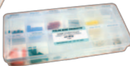
Small Clear Storage Container 10.25" x 5" x 1.75"