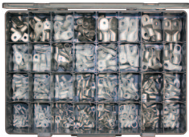
8 TO 4/0 GA PLATED LUG KIT Part Number KIT-BCL Heavy-duty closed-end plated copper eyelet lugs. 1/4", 3/16", 5/16" and 1/2" eyelets in 8 to 4/0 gauge. 355 pieces. Drawer satchel.