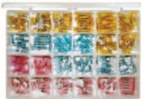
LARGE HEAT SEAL TERMINAL KIT 10-22 gauge heat seal ring, spade, and quick slide terminals in a variety of popular sizes, along with splices. 240 pieces. Large clear storage container. Part Number KIT-HEAT-SEAL