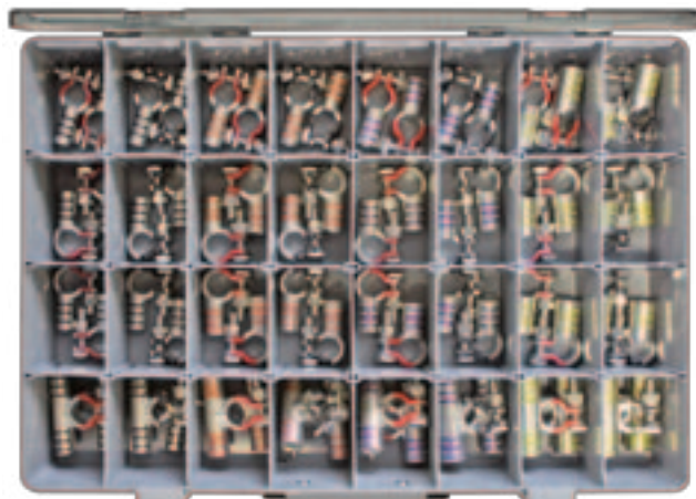
TERMINAL REPAIR KIT Part Number KIT-SCT Eco friendly top-mount flag, left, right, and straight solderless battery terminals in 1/0, 2/0, 3/0, and 4/0 gauge. 64 pieces. Drawer satchel.