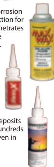
4 oz. 50010

CorrosionX® for Guns cuts through stubborn bore deposits for better cleaning, and decreases fouling, even after hundreds of rounds. Lubricates mechanisms and prevents rust, even in wet weather. Ideal for semiautomatics and automatics.