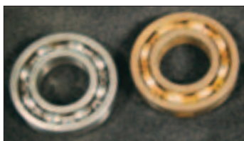
The bearing on the left was treated with CorrosionX; the one on the right was left untreated. Both were sprayed with seawater every day for two weeks. Note the remarkable difference.

CorrosionX® Heavy Duty forms a dripless, non-hardening, self-healing film that stubbornly resists removal by splash or spray—even full saltwater immersion. It penetrates rust and corrosion, removes moisture, stops electrolysis, then seals.