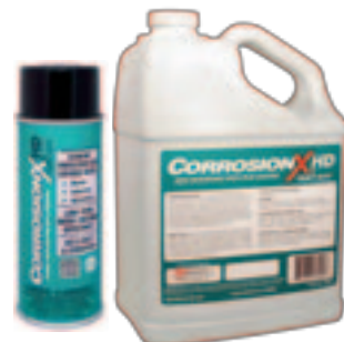
16 oz. Trigger Spray 80103 16 oz. Aerosol 80102 Gallon 84004

CorrosionX® Aviation , a product of aerospace research and development, is a special blend of inhibitors, lubricants and surface-active agents. Stops and prevents rust and corrosion. Lubricates better than Teflon® products. Penetrates and loosens frozen parts faster than other products designed for that purpose.