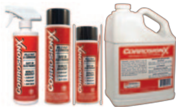
16 oz. Trigger Spray 91002 16 oz. Aerosol 90102 6 oz. Aerosol 90101

Polar Wire Products is an authorized distributor for Corrosion Technologies. For the complete line of CorrosionX® products, visit www.corrosionx.com